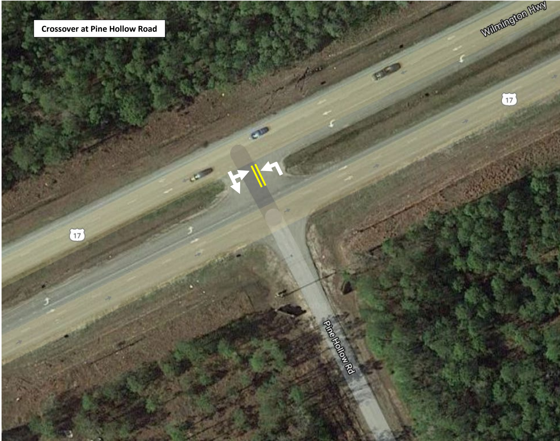
Crossover at Pine Hollow Road