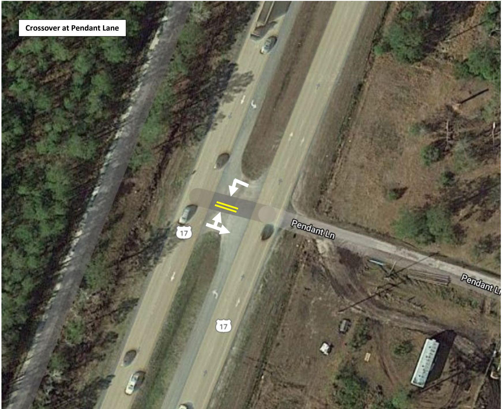
Crossover at Pendant Lane